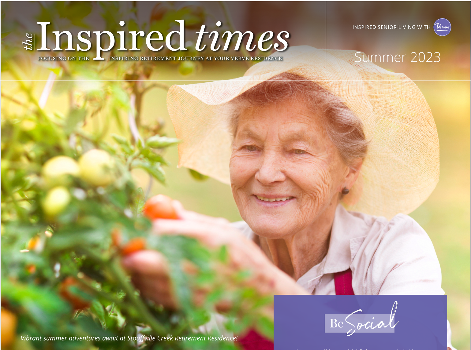
Vibrant summer adventures await at Stouffville Creek Retirement Residence!