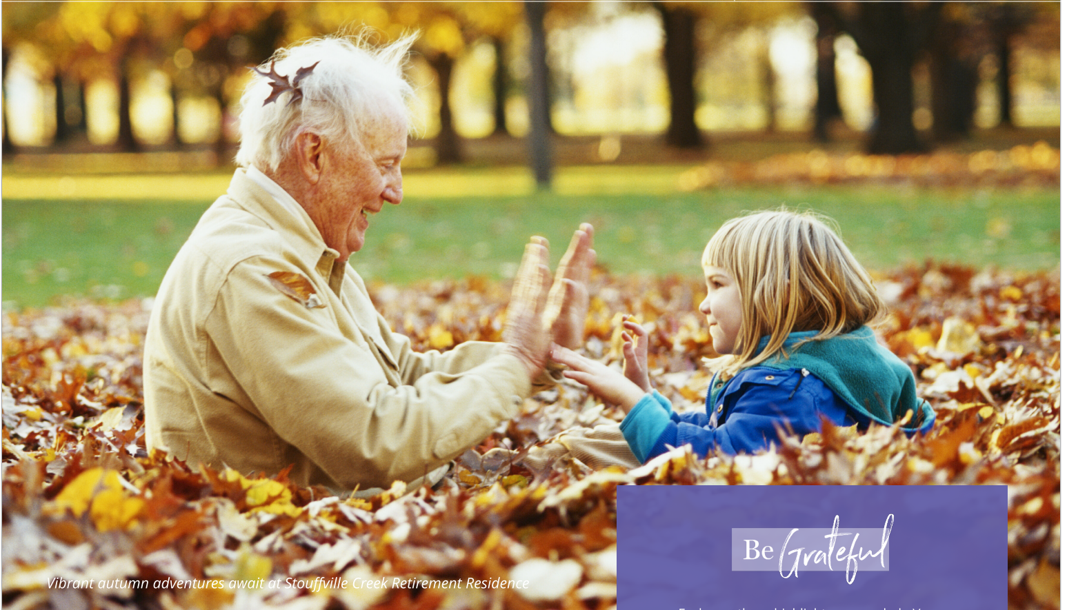
Vibrant autumn adventures await at Stouffville Creek Retirement Residence