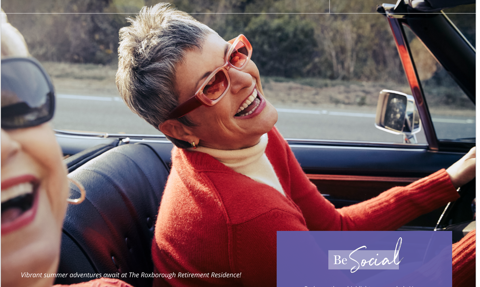
Vibrant summer adventures await at The Roxborough Retirement Residence!