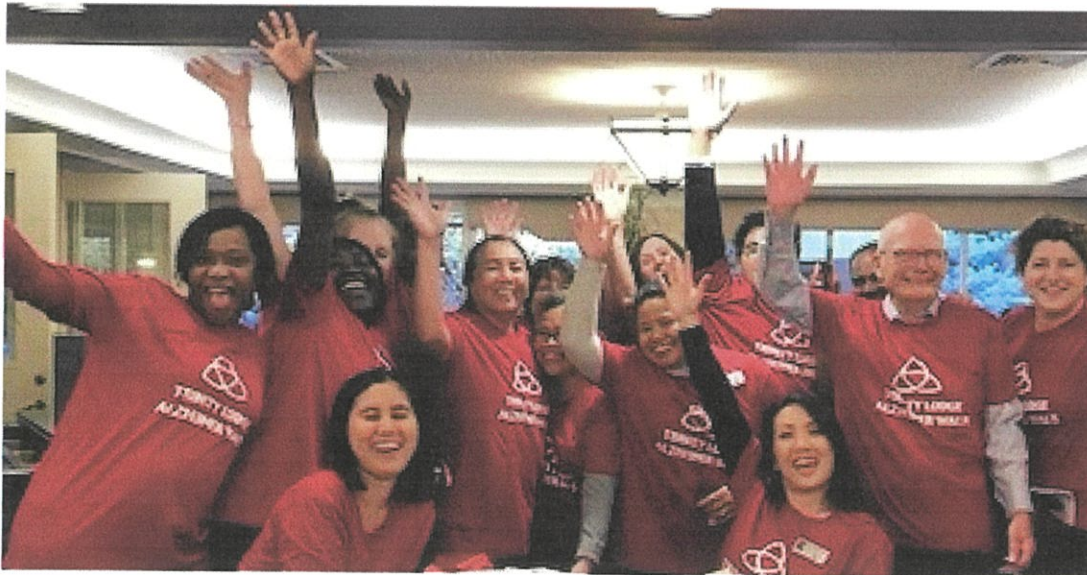
Team Trinity Lodge

Thank you for your support of this very worthy cause.