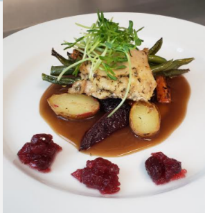
Chef Roberto Laqui Heartland Housing Foundation Roasted Chicken Thigh With Sautéed Green Beans and Roasted Root Vegetables Top With Pea Shoots and Served With Cranberry Sauce