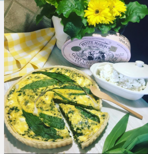
Chef Judi Black Childventures Spring Quiche Using Fresh Local Ramps and Goat Cheese