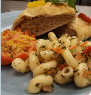
Charles Springer Seaton House Homestyle Tuna Turnover