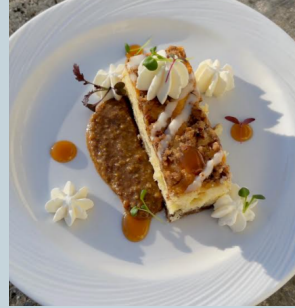
Verve Granville Gardens Retirement Residence