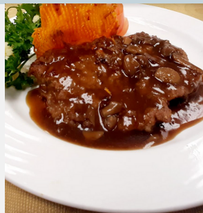
Todd Westlake White Cliffe Terrace Retirement Residence Veal Marsala With Sweet Potato Gaufrettes