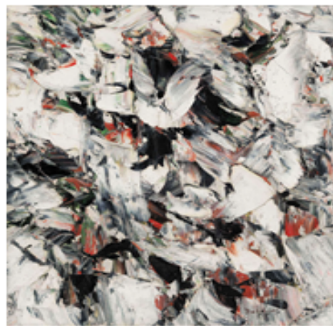
Persistence of Blacks , 1955