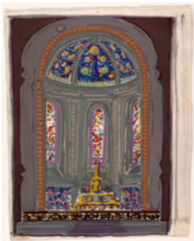
Decorative Project , 1927