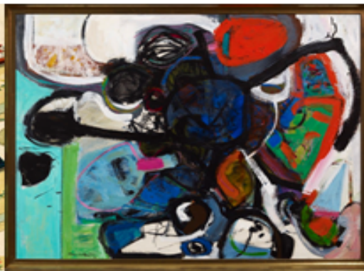
Traumoebe , 1956