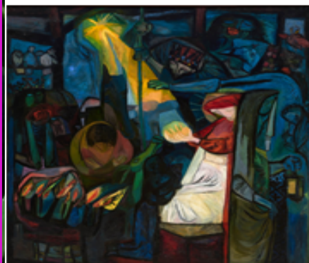
The Adoration , 1949