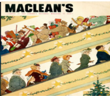
Illustrations , 1952