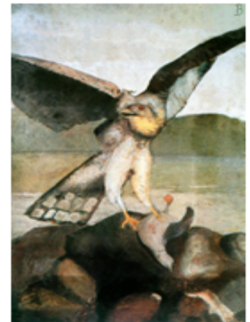
The Study of a Sparrowhawk in a decorative landscape , 1924