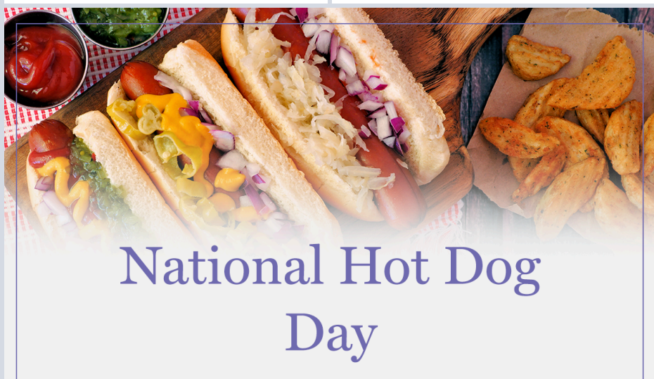
National Hot Dog Day