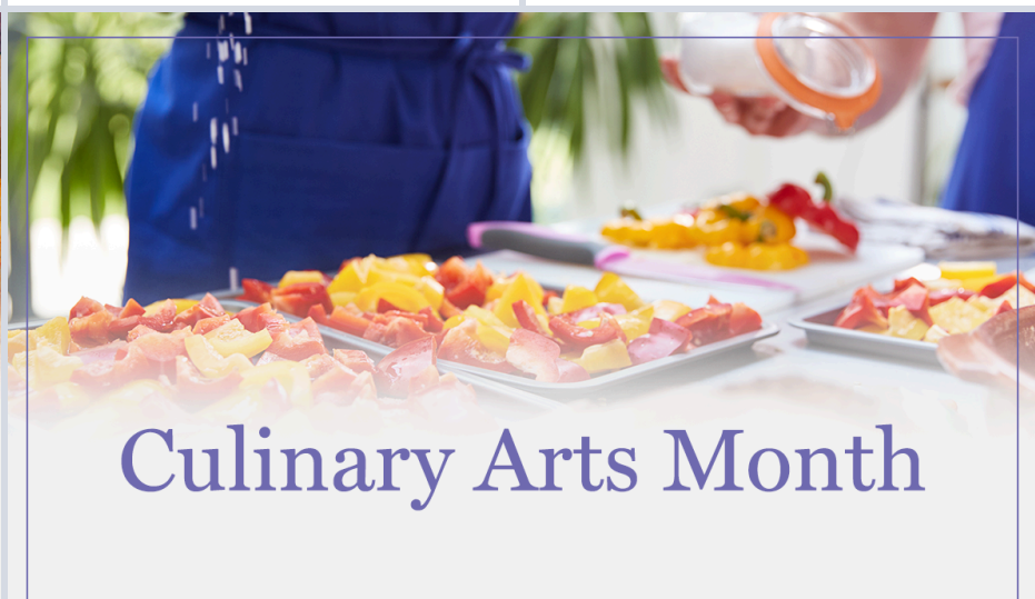
Culinary Arts Month